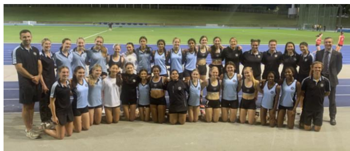
Meriden's NSW Schools Athletics Team