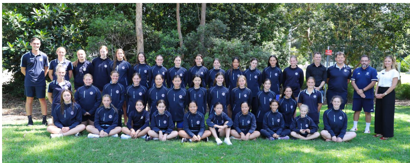
2023 Meriden IGSA Swimming and Diving Team