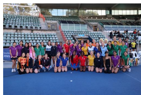
Competitors in Meriden's 2023 Sisters Relay race

The Year 12 versus Staff Relay was also a very close competition with Year 12 students ultimately winning the race after a strong performance.