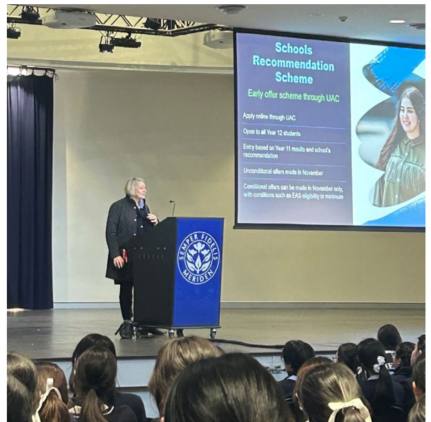
Students hearing about University applications